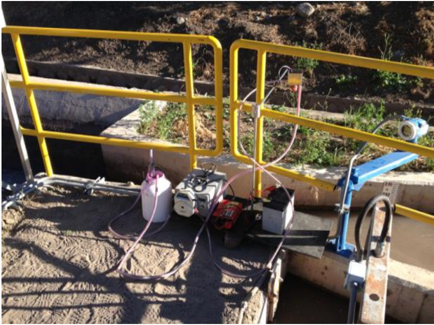
Injection of the measurement fluorescent tracer