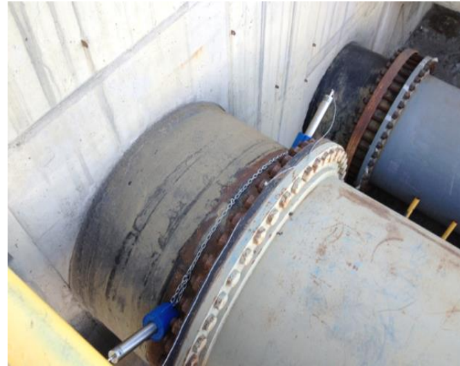
Detectors of the radioactive tracer passage