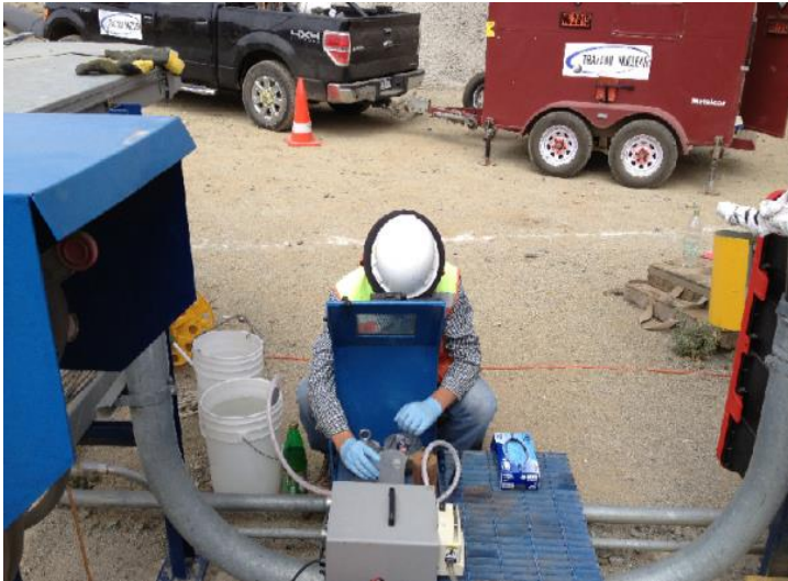
Injection of the radioactive tracer